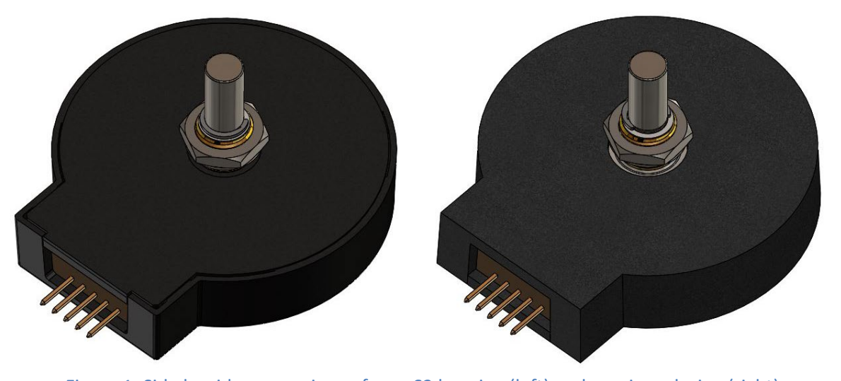
Figure 1, Side by side comparison of new S2 housing (left) and previous design (right)

The draft parting line direction of the housing has been moved from the top surface to the bottom of the encoder, resulting in a slight change in the taper of the housing when viewed from the side. The comparison images below illustrate the differences.